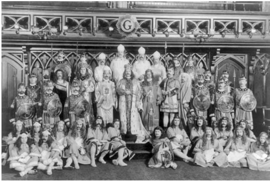
A group of Freemasons in ceremonial dress, 1902.

The Grand Masonic Lodge was created in 1717 when four small groups of lodges joined together. Membership levels were initially first and second degree, but in the 1750s this was expanded to create the third degree which caused a split in the group. When a person reaches the third degree, they are called a Master Mason. Masons conduct their regular meetings in a ritualized style. This includes many references to architectural symbols such as the compass and square. They refer to God as “The Great Architect of the Universe”. The three degrees of Masonry are: 1: Entered Apprentice, this makes you a basic member of the group. 2: Fellow Craft, this is an intermediate degree in which you are meant to develop further knowledge of Masonry. 3: Master Mason, this degree is necessary for participating in most masonic activities. Some rites (such as the Scottish rite) list up to 33 degrees of membership. Masons use signs and handshakes to gain admission to their meetings, as well as to identify themselves to other people who may be Masons.