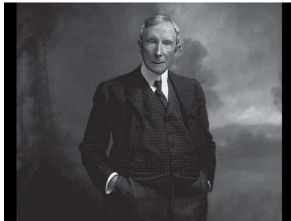
John D. Rockefeller (1839-1937)

The Rothschilds have a very long and dark history. They have caused mayhem for centuries. John D Rockefeller came to power when he became an very rich in the oil industry in the 1800s.